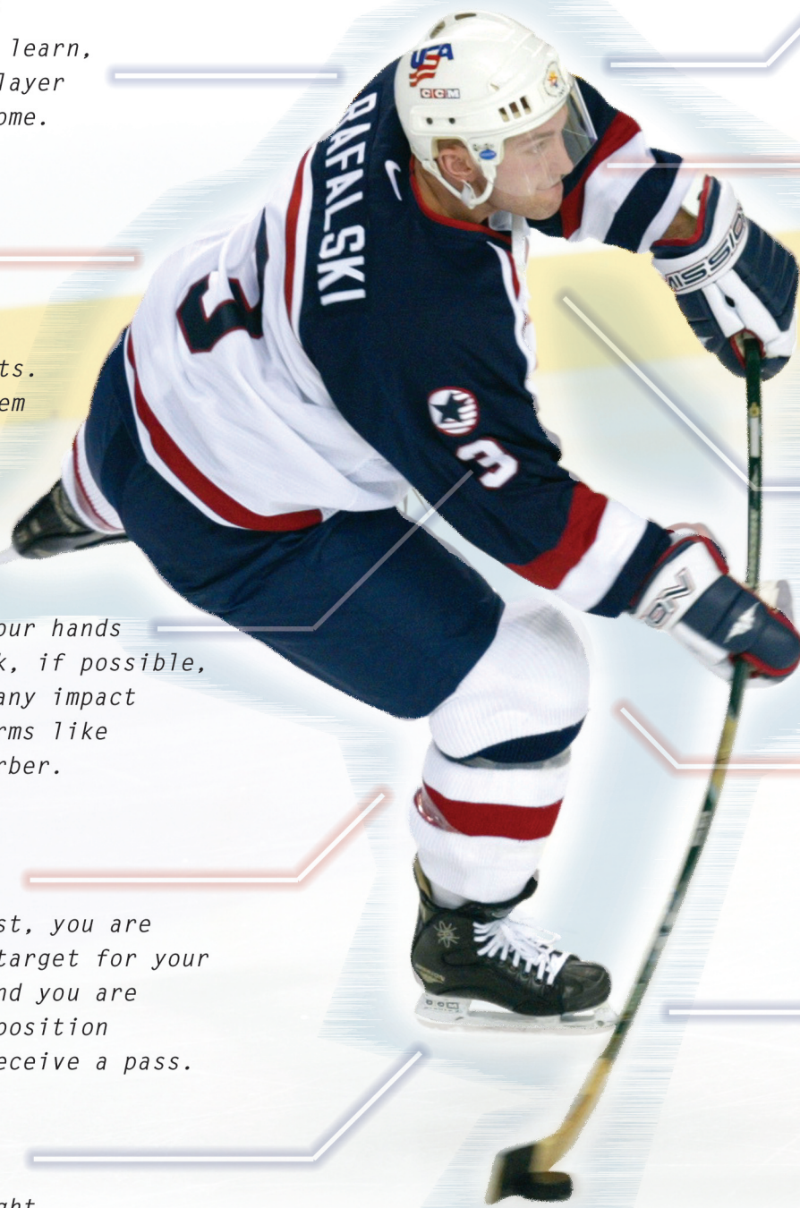
Brian Rafalski 2002 Olympic Silver Medalist

Sticks and skates are what make you a hockey player. They are never to be used against an opponent in a dangerous manner.